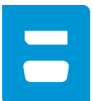
Ports: Display, VGA